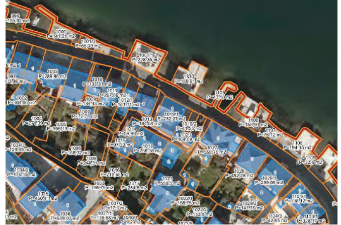
View of cadastral plots

MUNICIPALITY-----KOTOR CADASTRAL MUNICIPALITY-----KO PRČANJ I PROPERTY AREA-----152 m 2 PROPERTY PRICE IN EUR-----ON REQUEST ID NUMBER-----ME10242B01001