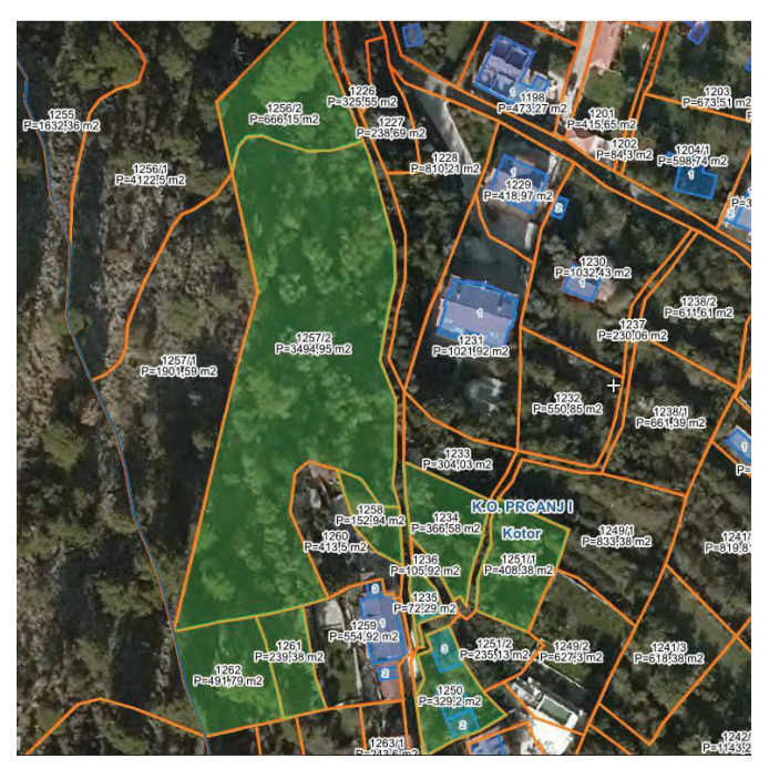
View of cadastral plots(GeoPortal Montenegro)