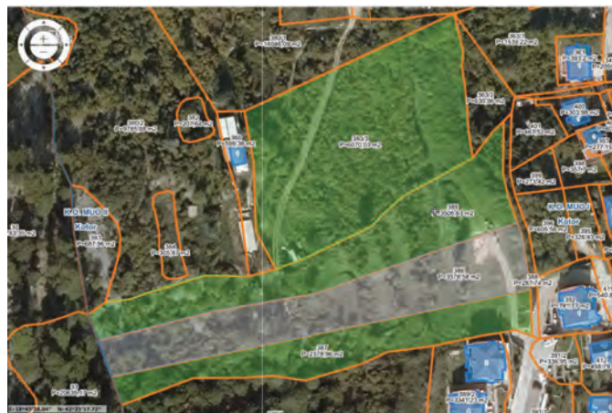
View of cadastral plots(GeoPortal Montenegro)

MUNICIPALITY-----BUDVA CADASTRAL MUNICIPALITY-----KO MUO I PROPERTY AREA-----11.964 m2 PROPERTY PRICE IN EUR-----ON REQUEST ID NUMBER-----ME10034L01001 i ME10035L01001