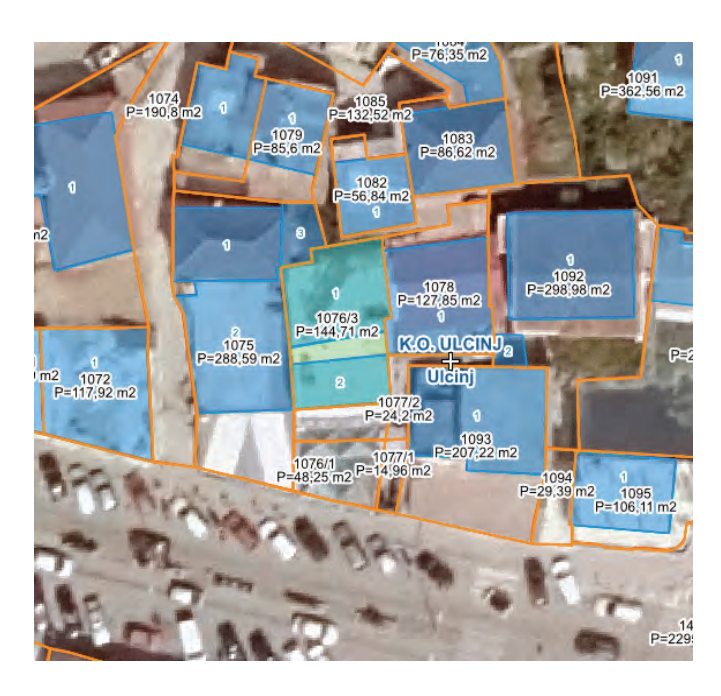
View of the cadastral plot (GeoPortal Montenegro)