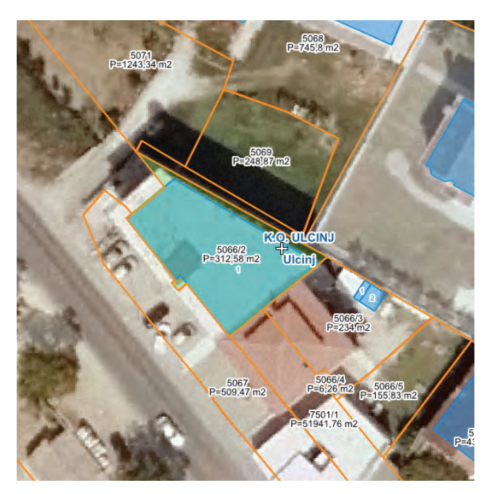
View of the cadastral plot for the building in which is the real estate (GeoPortal of Montenegro)